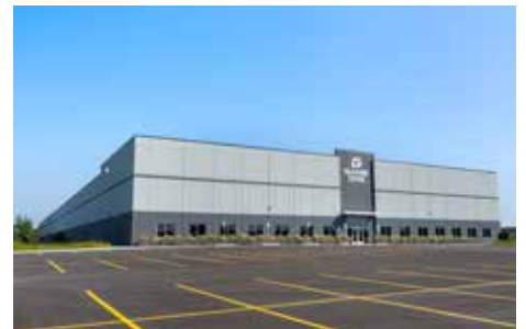
Game One — Swanton, OH