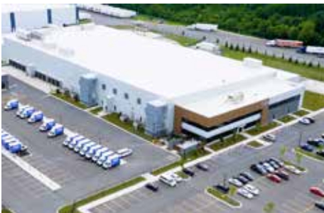
The Kroger Co. — Romulus, MI