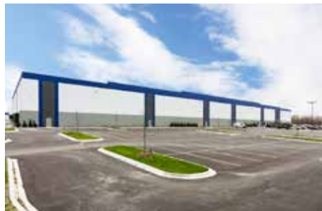
Penske Logistics — Romulus, MI