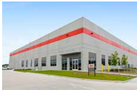
Frito-Lay — Baton Rouge, LA